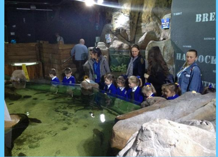
Trips and visitors